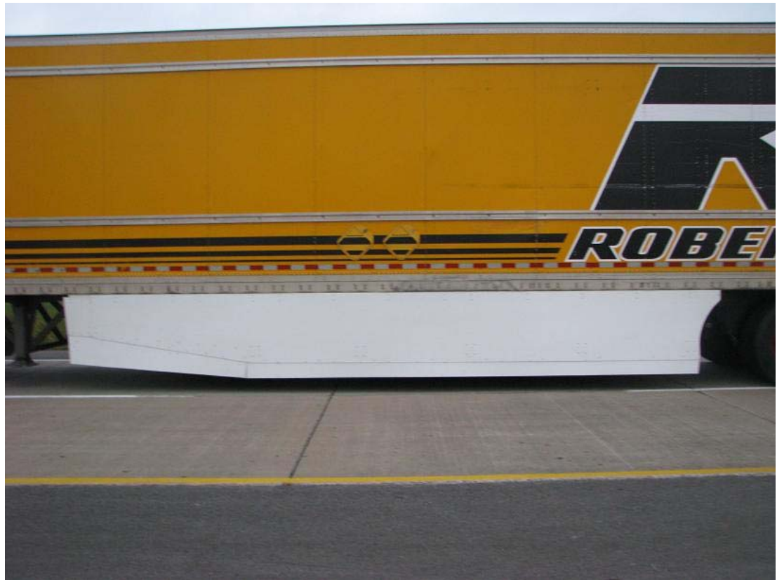
Figure 4. The tested technology: trailer skirt prototype no. 2.