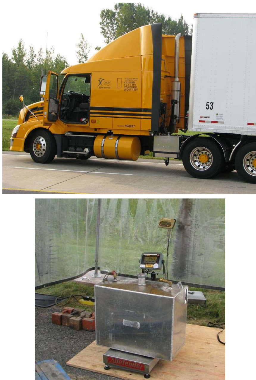
Figure 2. Installation and weighing of the temporary fuel tank.

The repeatability of the scale measurements was periodically checked during the tests using a set calibration weight.