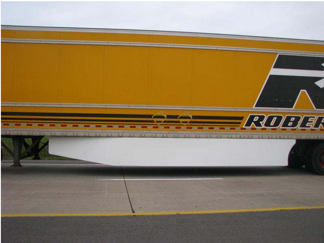
Figure 5. The tested technology: trailer skirt prototype no. 3.