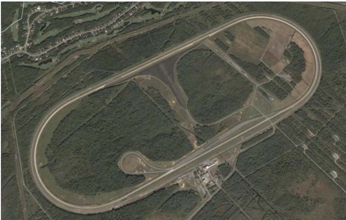
Figure 1. Aerial view of the Blainville test site.

The Energotest 2008 project took place from 2 to 12 September 2008 at Transport Canada's Motor Vehicle Test Centre (MVTC) in Blainville (Quebec), which is currently operated by PMG Technologies. The fuel-consumption tests were performed on the high-speed test track (BRAVO). This track is a high-banked, parabolic oval with a length of 6.4 km (4 miles). The length of a test run was 15 laps (almost 100 km), with departure and arrival at the same position along the track. Figure 1 shows the test site.