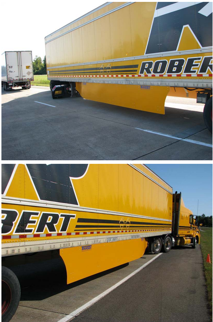
Figure 3. The tested technology: prototype trailer skirt no. 1.

time, were recorded for information purposes only. In order to avoid potential problems related to the instruments, three recently calibrated scales were available on the site. For each run, the portable tanks were weighed using the same portable scale. Furthermore, the scales were checked against a known weight of 90.72 kg (200 lb) before each series of readings. The portable scales were not moved between the initial and final weighings for a given test run. Distance measurement was not a factor because for each run, all the vehicles departed and arrived at the same point after traveling the same number of laps and following the same path along the track.